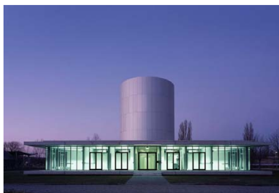
Figure 5: LACIS building, including LACIS tower, laboratories and offices.

In addition to LACIS itself, the new LACIS building (see Fig. 5) offers laboratory space for setup, calibration, etc. of guest experiments and instruments.