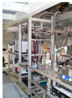
Figure 2: Particle generation unit of LACIS.

Particles to be investigated with respect to, e.g., their potential to act as cloud condensation and/or ice nuclei, are introduced into LACIS in form of a narrow 2 mm wide beam surrounded by particle free sheath air (see Fig. 3). Both, the particles and the sheath air flows are humidified using saturators the temperatures of which are controlled by thermostats.