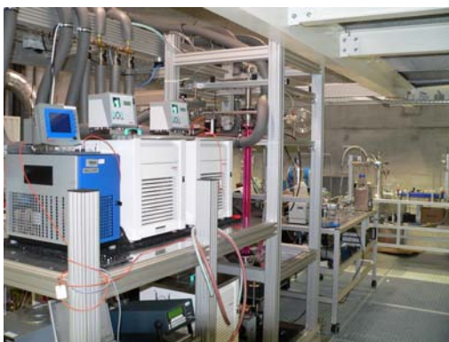
Figure 1: View of LACIS. In the front the thermostats can be seen, which are used for conditioning of aerosol, sheath air flow and chamber. The pink tube in the back is the chamber itself.